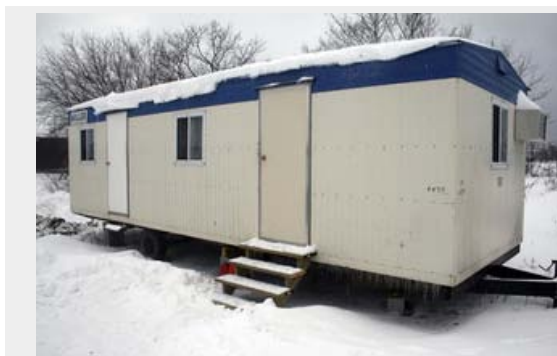
After the local OSPCA shut its doors in December, the Town of Parry Sound opened its own temporary impound facility on MacFarlane Street to house stray dogs.

To house stray dogs, McDougall, Parry Sound and Seguin joined in on a temporary Parry Sound-run dog pound in a town-owned trailer.